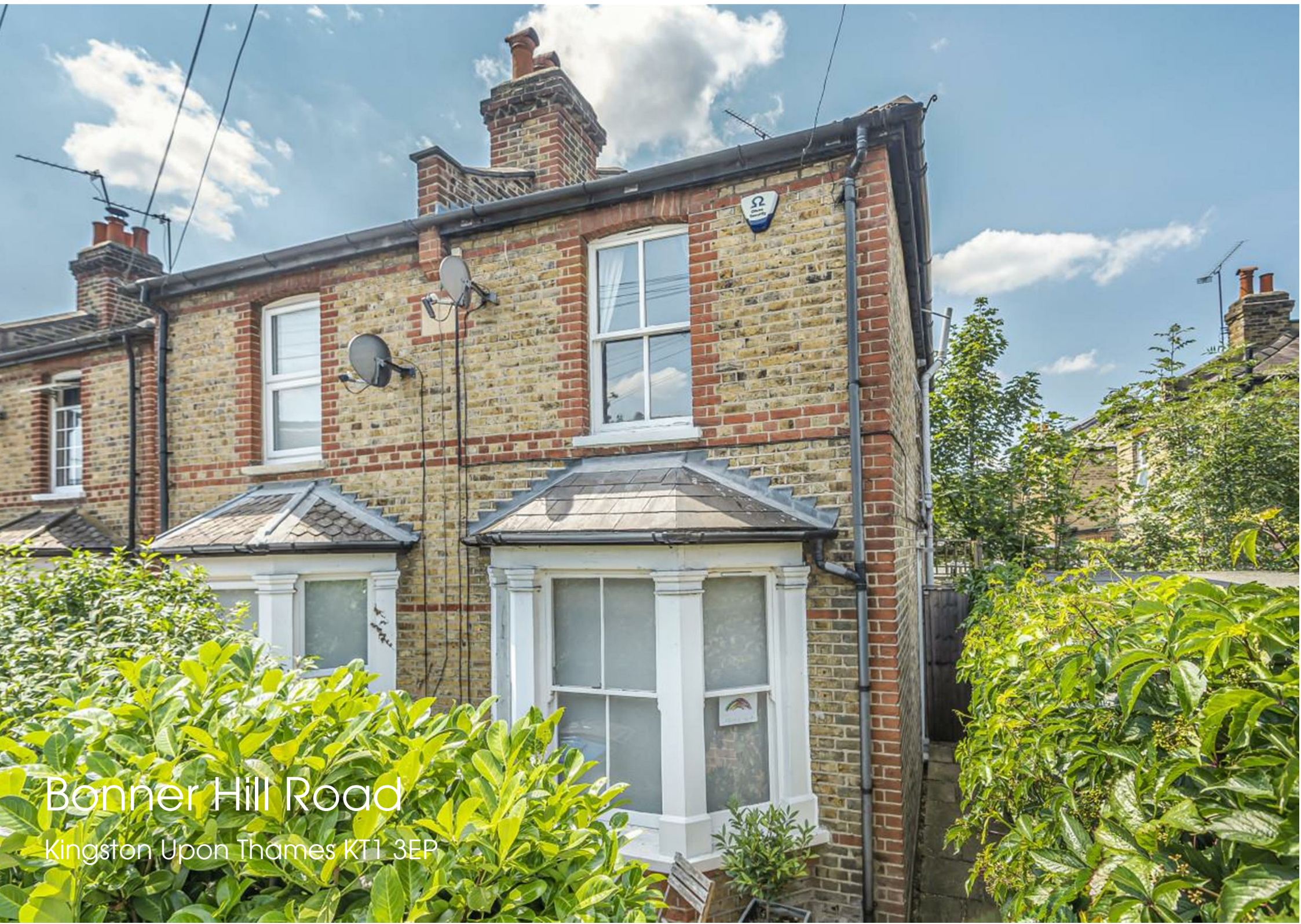
Bonner Hill Road Kingston Upon Thames KT1 3EP